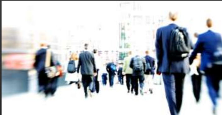
Society Around The Business