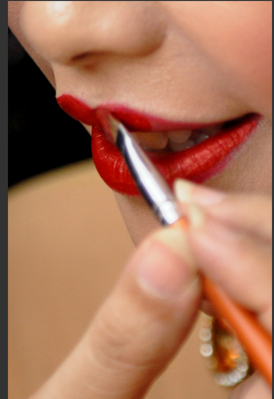
Extreme Close Up